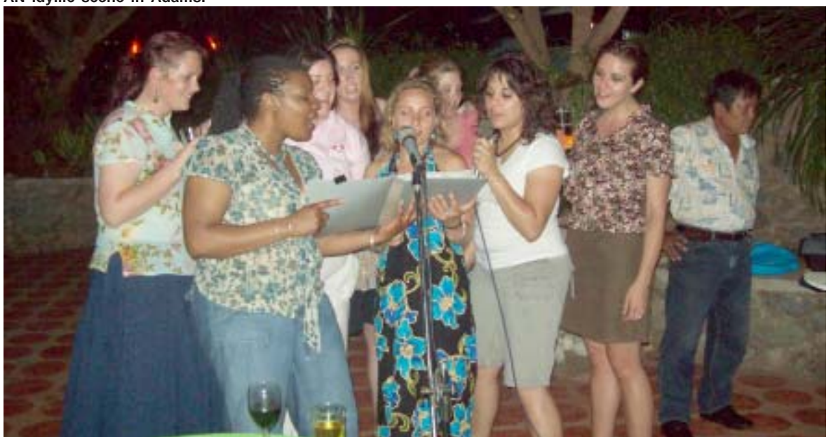
ROTARY GSE visitors from Wales and Wisconsin having a good time at Gertes Resort.