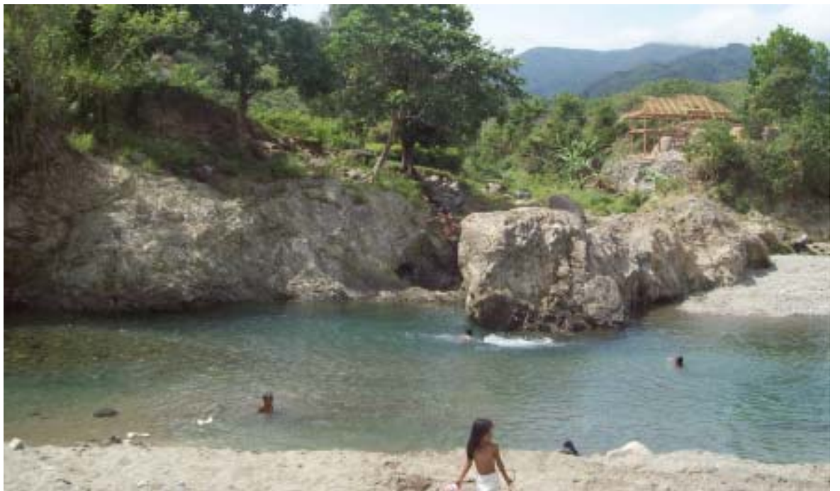
AN idyllic scene in Adams.